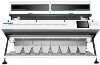
MEYER COLOUR-SIZE SORTER Made in USA