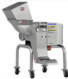
URSCHEL CUTTING MACHINE Made in USA

Food processing is a transformation of raw agricultural products into food suitable for human consumptions. We at Metro foods uses high-end machines from all over the world which helps in improving the quality of food products by ensuring that they are consistently produced at same high standards. These machine increases the efficiency of food productions by automating many of the task involved in food processing.