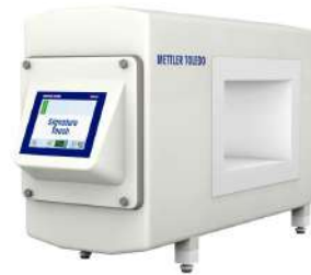
METTLER TOLEDO Made in USA