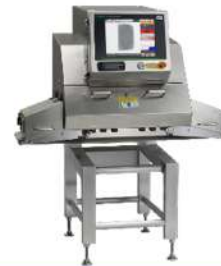
ANRITSU X-RAY MACHINE Made in Japan