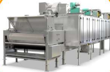
WOLVERINE PROCTOR DRYER Made in USA